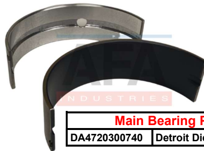
Main Bearing Pair - STD