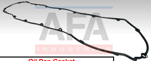
Oil Pan Gasket