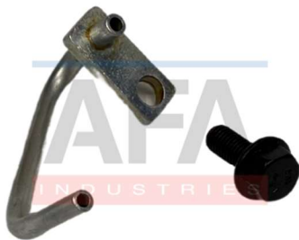
Piston Cooling Nozzle