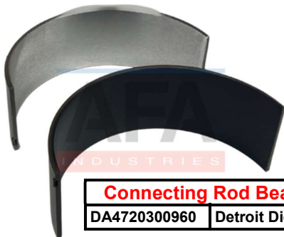
Connecting Rod Bearing Pair - STD