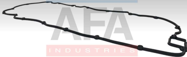
Valve Cover Gasket

AFA Industries is pleased to announce the availability of new engine parts and kits for popular Caterpillar®, Cummins®, Detroit Diesel®, and Navistar® applications. Contact your local sales representative or AFA Certified Distributor for more information.