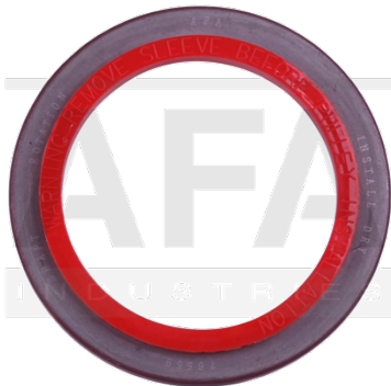
Front Crankshaft Seal 2885726 | Caterpillar | C9