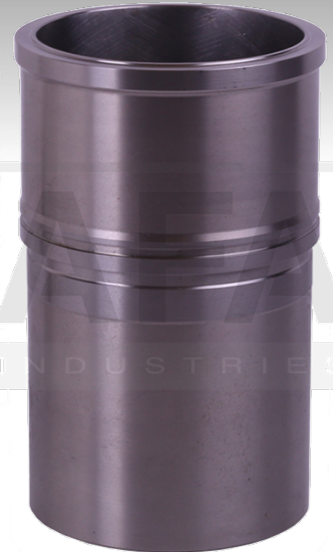
Liner without Sealing Ring 1979330 | Caterpillar | C12/C13