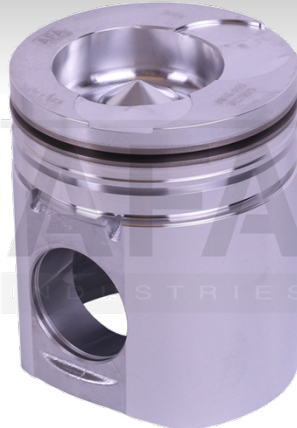
Piston Body without Pin N1822097C2 | Navistar | DT466