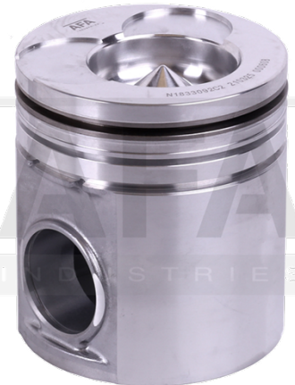
Piston Body without Pin N1833092C2 | Navistar | DT466E