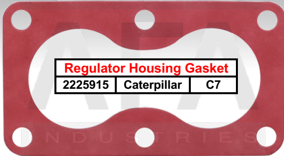
Regulator Housing Gasket 2225915 | Caterpillar | C7

AFA Industries is pleased to announce the availability of new engine parts and kits for popular Caterpillar®, Cummins®, Detroit Diesel®, and Navistar® applications. Contact your local sales representative or AFA Certified Distributor for more information.