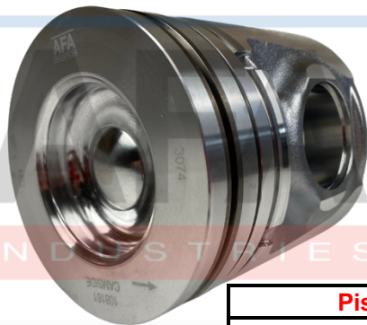
Piston Body w/o Pin