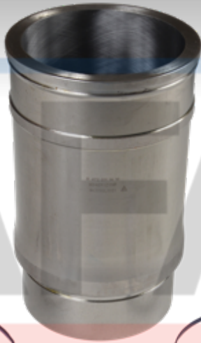
Liner with Sealing Ring

AFA Industries is pleased to announce the availability of new engine parts and kits for popular Caterpillar®, Cummins®, Detroit Diesel®, and Navistar® applications. Contact your local sales representative or AFA Certified Distributor for more information.