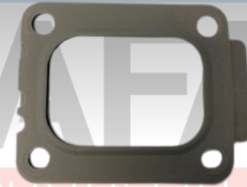
Turbocharger Mounting Gasket